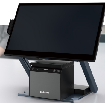
EASY TO PLACE